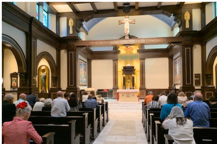
District 7 Serrans, St. Junipero Serra Feast Day Celebration at St. John Vianney Seminary Chapel

The priest then came up after the Gospel to preach the homily. The priest was talking about the world itself and how everyone has different opinions in the world. Everyone has their different beliefs, religious or political, but all of that is just opinion to the one true fact which is God. Whenever I feel indifferent to someone else, I should listen to God, because God is the only one who says the full truth. He is the only one without sin. I believe that if we all came together as brothers and sisters and follow the word of God, we would all be one in the spirit. In going to Mass, I always forget my hardships in life. I forget my conflict with others. I go to Mass to pray to my Lord for just an hour a day, but that completely lifts my spirit, and I can feel a joy like no other. Getting to go to St. Thomas Seminary was such a spiritual joy for me, and a great lesson for how God can speak to you and you speak to Him. I may not know my vocation yet, but my heart is joyous knowing that my path with God is continuously moving up the hill of life. I know I am still far from the top but when I get there and God can reveal to me my one true vocation in life, I will know that the climb was worth every step of the way.