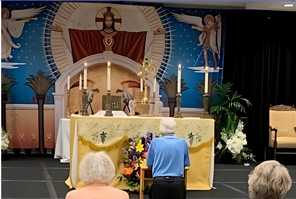
Serran Prayers in the Hilton Ballroom Adoration Chapel