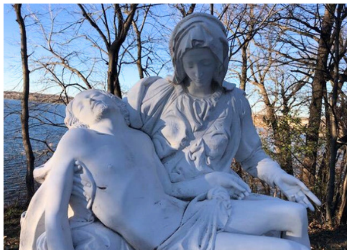
Christ the King Retreat Center, Buffalo, MN

For Catholic women, ages 16-35, who are discerning consecrated life. Women are usually accompanied by their Pastor, Consecrated Religious, or Youth Minister. Event will be held at the Archdiocesan Catholic Center.