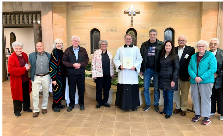
Holy hour participants visited with Father.