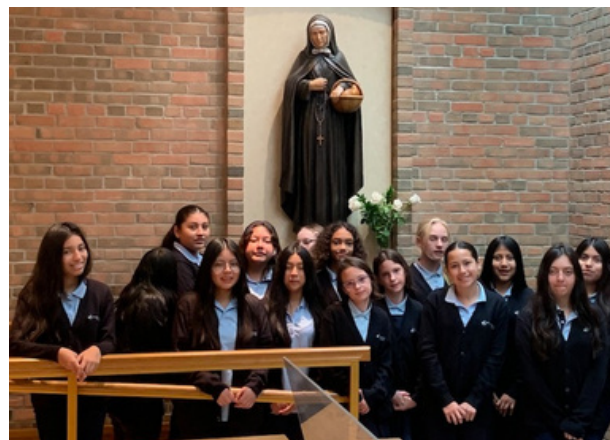
St. John Paul II students in Little Sisters of the Poor Chapel.