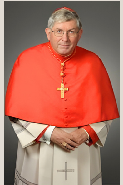
Cardinal Tom Collins

An online speaker series with vocations in mind