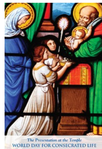
The Presentation at the Temple WORLD DAY FOR CONSECRATED LIFE

Several times a year, the Church provides opportunities for the faithful to celebrate vocations. World Day for Consecrated Life is one of four National Vocations Awareness Events. Others are: World Day of Prayer for Vocations in May, Priesthood Sunday in September, and National Vocations Awareness Week in November. We do not need a special day, however, to say thanks. Every day is appropriate to thank God and thank the men and women who answer a call to ordained or consecrated life.